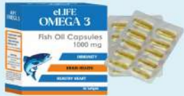
eLIFE OMEGA 3