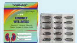
eLIFE Kidney Wellness