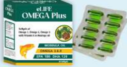
eLIFE OMEGA PLUS