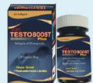
eLIFE Testoboost Plus