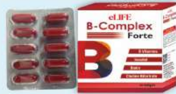
eLIFE B-Complex Forte