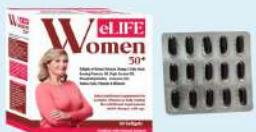
eLIFE WOMEN 50+