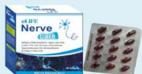
eLIFE NERVE CARE