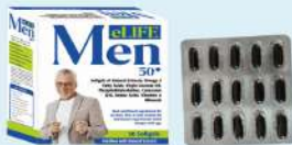
eLIFE MEN 50+