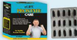
eLIFE PROSTATE CARE