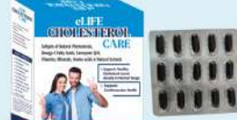
eLIFE CHOLESTEROL CARE