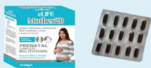
eLIFE MOTHER 2B