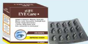
eLIFE EYE CARE+