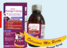
eLIFE Omega-3 Syrup