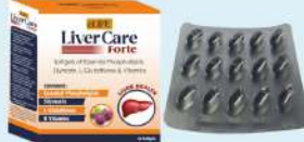
eLIFE LIVER CARE Forte