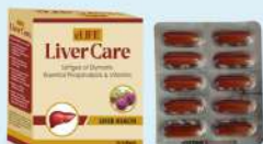
eLIFE LIVER CARE