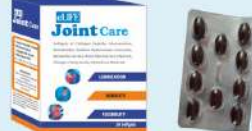
eLIFE JOINT CARE