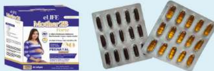
eLIFE MOTHER 2B Forte